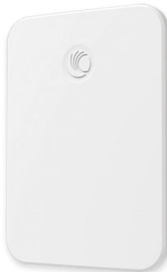
ePMP MP 3000 MicroPOP